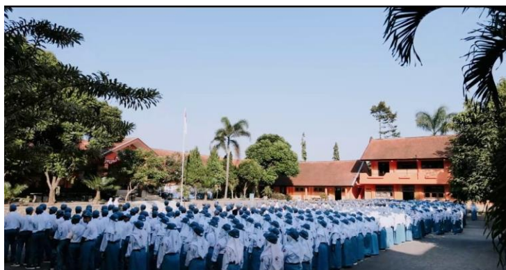
Figure 1. Habituation of discipline in conducting ceremonies and morning roll calls

carry out religious obligations with full awareness. 2) Justice ( Adil ): We teach the importance of being fair in human relationships and respecting the rights of others. 3) Care ( Ihsan ): We encourage students to do good and care for others and the environment as a form of worship to Allah. 4) Servanthood ( Tawadhu' ): We teach the importance of having a humble attitude not being arrogant, and always being willing to learn from others. 5) Social Care ( Mu'amalah ): We encourage students to interact with others appropriately and help others in difficulty. 6) Discipline ( Taat ): We teach the importance of discipline in carrying out obligations and rules, both at school and in society. 7) Honesty ( Sidq ): We emphasize the importance of being honest in speech, actions, and attitudes and avoiding dishonest behaviour. The following is one form of student discipline (Ariani, 2023).