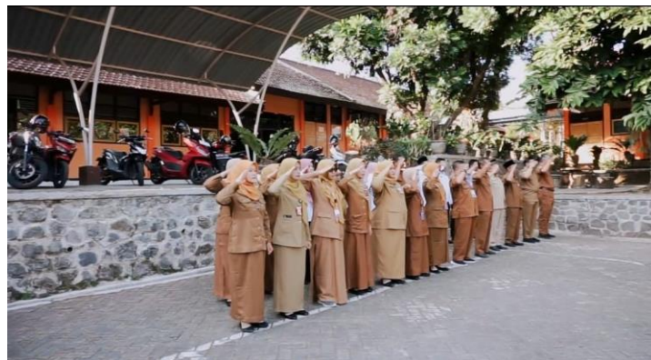
Figure 2. Teacher discipline in ceremonial activities

Islamic character building through habituation requires commitment from all school stakeholders (Dogra et al., 2021). The school establishes rules that must be adhered to by the entire school community, with discipline serving as the primary determinant of this habituation method (Banzon-Librojo et al., 2017; Satriawati et al., 2023). Teachers' personalities are continually refined through professional development activities, which may include seminars or religious strengthening through public recitations. The most crucial stakeholder in the implementation of character building is the teacher. Teachers need to exemplify uswah hasanah for students, instilling in them the habit of doing good. This, of course, will only be realized through consistent efforts (Adiyono et al., 2022; Asmarani et al., 2021). Teachers serve as the vanguard in building the school culture.